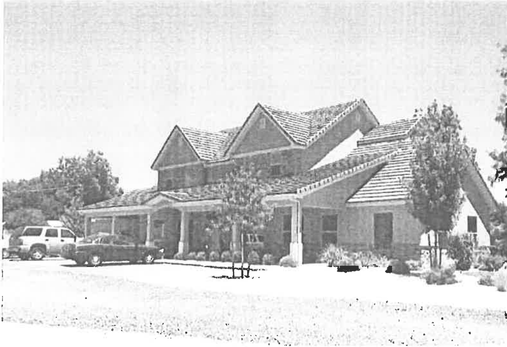
ST. GEORGE CENTER