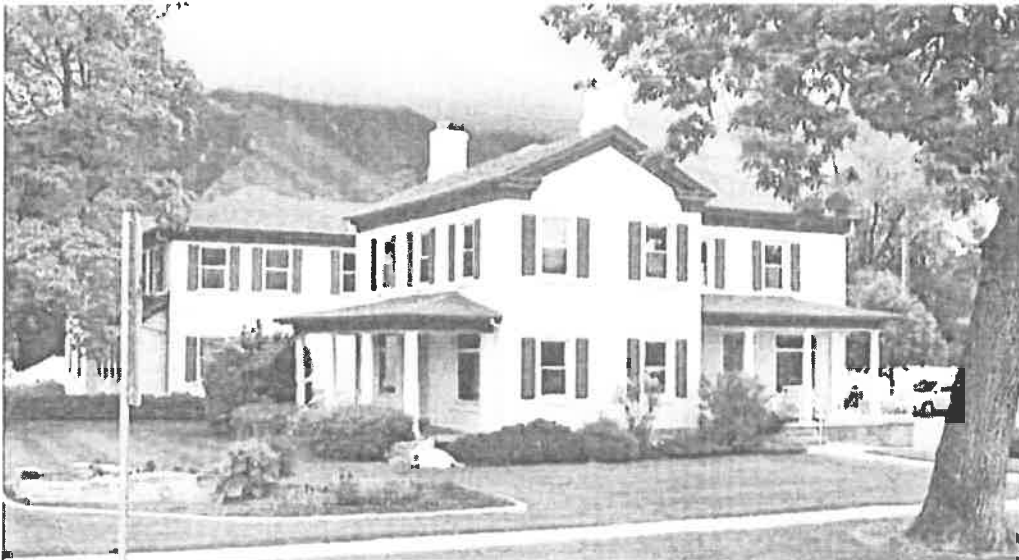
UTAH County Center